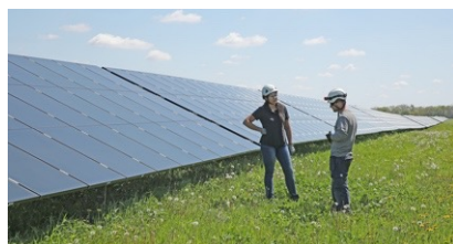
Invenergy's Grand Ridge Energy Center located in LaSalle County, Illinois.

Annual donations to local education, emergency & veteran services, and environmental stewardship