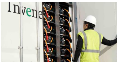
Storage at Invenergy's Grand Ridge Energy Center in LaSalle County, Illinois

Commits to developing projects while minimizing impacts to sensitive ecological resources and ensuring responsible land use